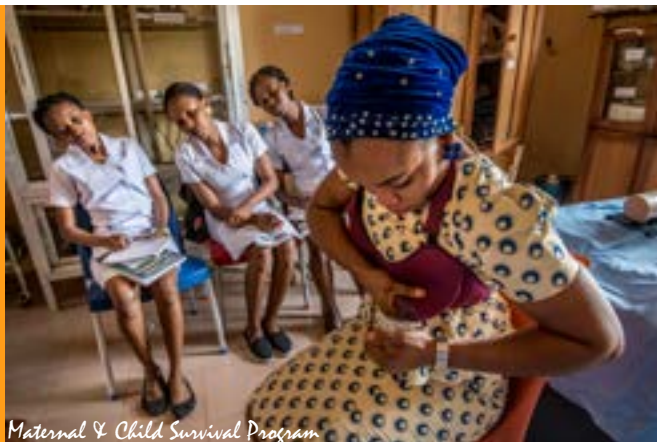
Maternal & Child Survival Program

*Includes booth construction, electricity supply, fascia board with company name, daily floor cleaning. 1 table and 2 chairs, internet cable connection, any meals and refreshments offered during the Conference.